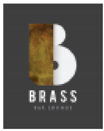
0.86 inches x 1.11 inches

For maximum performance, it is recommended that the minimum size for reproduction of the artwork be 17mm across.