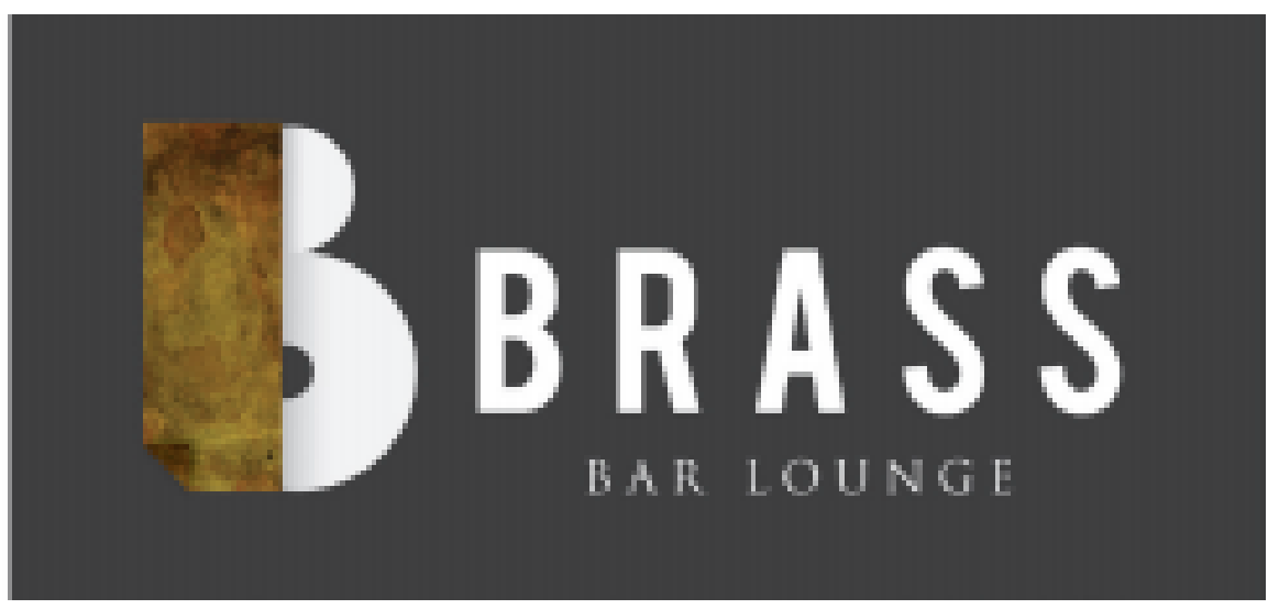
LOGO ARTWORK OPTION 2