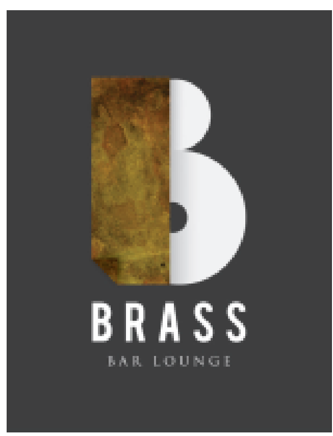
LOGO ARTWORK OPTION 1